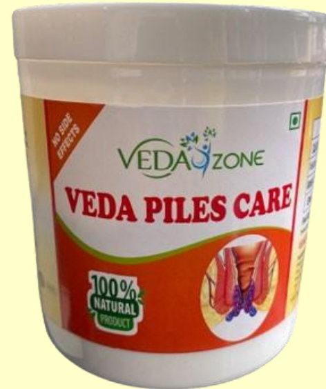
Veda PILES Care Rs.1200/- (600 BV)