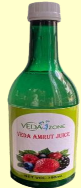
Veda Amrut Juice Rs.1200/- (600 BV)