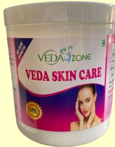
Veda Skin Care Rs.1200/- (600 BV)