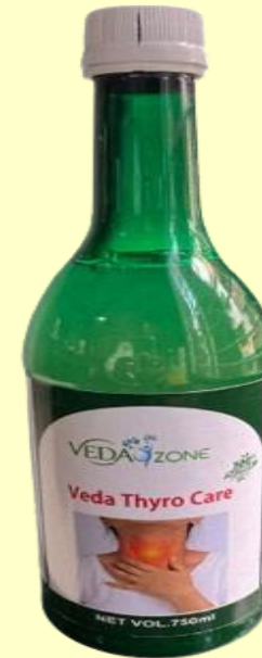
Veda Thyro Care Rs.1200/- (600 BV)