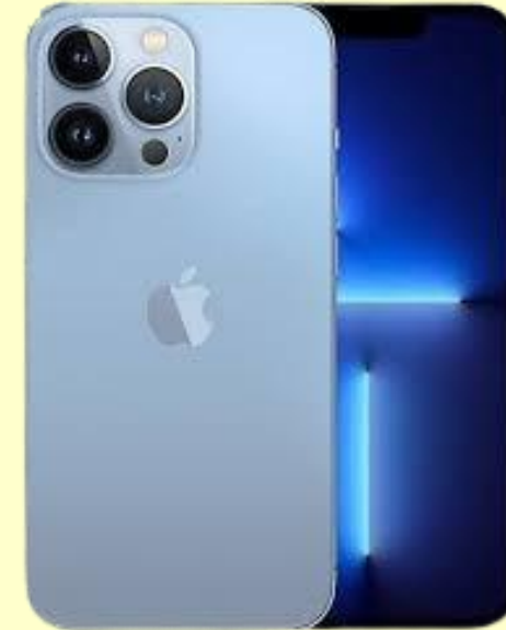
(400 Pair) 50,000/- Cash for i Phone PLATINUM