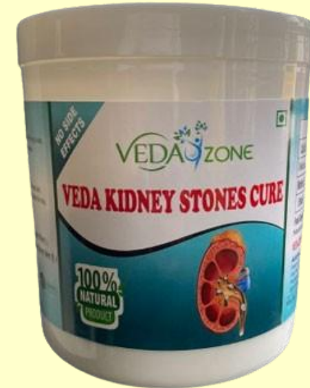
Veda Kidney Stones Cure Rs.1200/- (600 BV)