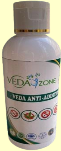
Veda Anti Addition Rs.1200/- (600 BV)