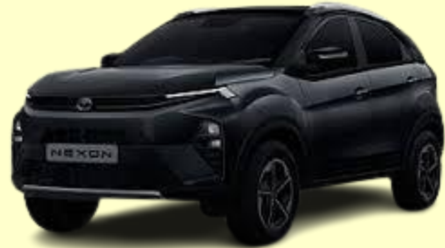
Tata Nexon (10000 Pair) CROWN DIAMOND