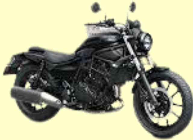
Kawasaki Eliminator (5000 Pair) BLUE DIAMOND