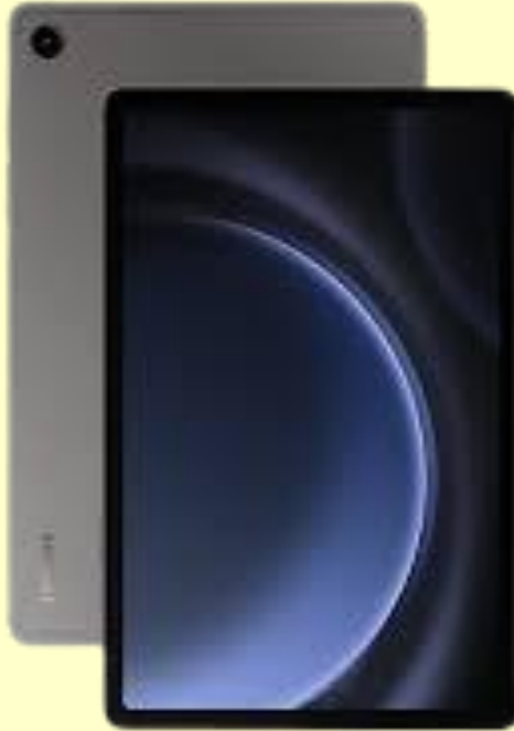
Samsung Tablet (200 Pair) WHITE GOLD