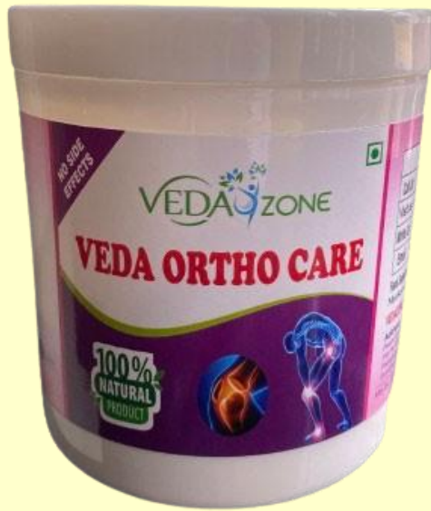
Veda Ortho Care Rs.1200/- (600 BV)