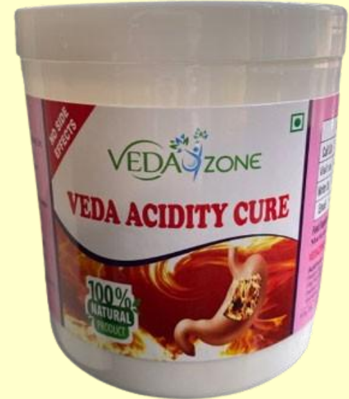
Veda Acidity Cure Rs.1200/- (600 BV)