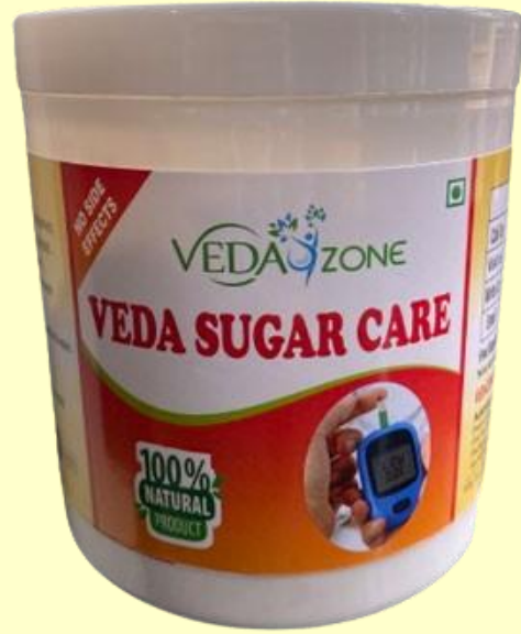
Veda Sugar Care Rs.1200/- (600 BV)