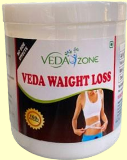
Veda Waight Loss Rs.1200/- (600 BV)